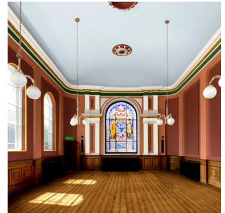
1 The restored Council Chamber

The project has been running since winter 2020, when consultations with the public identified what local people wanted to see in the building. We have incorporated as many as possible of the top items from the consultation in our designs, and so the Town Hall will include a Heritage Gallery linking to all the museums in town, space for the Town Council, Lowestoft Registrars' offices, a café, and meeting and events spaces for community groups, along with a courtyard garden.