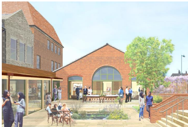
5 Courtyard garden and events space

Our activity plan, which is where the community can really get engaged, ran through most of the last two years, and now we're kicking off the next stage of it. For the next five years, ie throughout the construction project and then once the Town Hall opens, we'll run lots of different activities where people can participate in workshops, learn how to make films, develop a digital archive or contribute to the first exhibitions in the Town Hall.